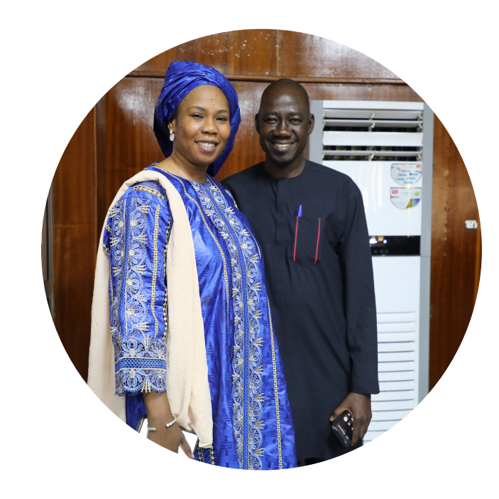
Expanded Nutrition and Teen Peer Program